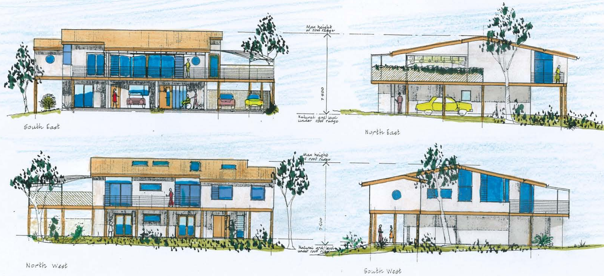
1:200 scale plan and elevations of existing house at 7 Inlay St, Merimbula NSW 2548